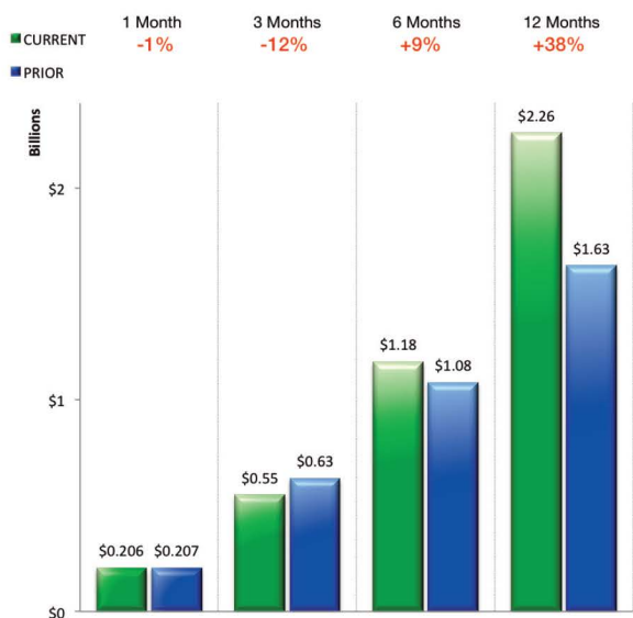
VALUE OF LOANS Current Month(s) Versus Prior Month(s)